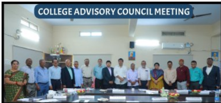
COLLEGE ADVISORY COUNCIL MEETING