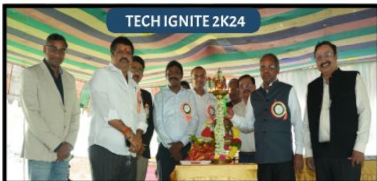
TECH IGNITE 2K24