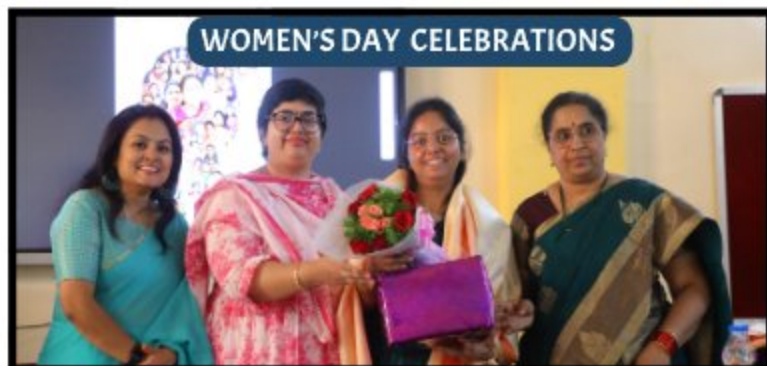
WOMEN'S DAY CELEBRATIONS