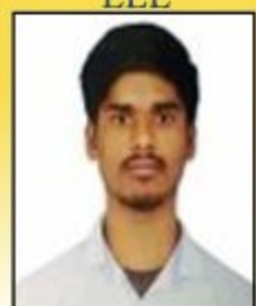
TDEVENDAR 22Q65A0212 CGPA-8.14